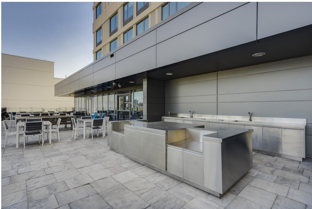
Outdoor kitchen and dining area, taken in June before the grills were installed in their island

The fitness center and the yoga studio sit next to the terrace's large lawn.