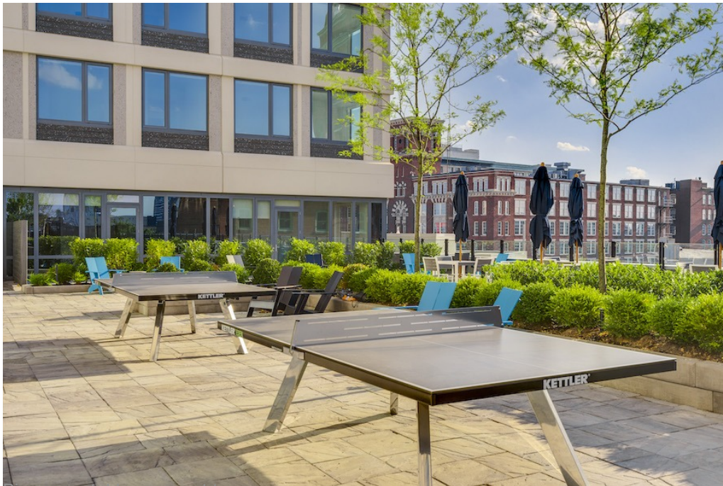
Ping-pong tables on west terrace

“This room really does four seasons,” says Levine.