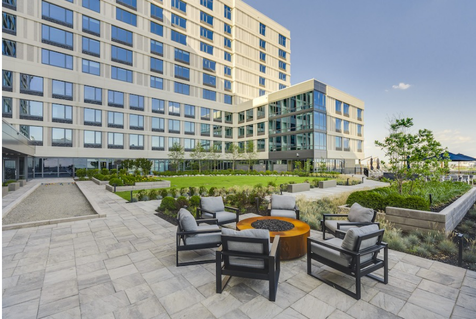
Fire pit and bocce court

The club room next to the outdoor dining area has pool and shuffleboard tables. It also has a demonstration kitchen lavishly equipped with Miele appliances that include a microwave/convection oven, an induction cooktop, a warming drawer and a griddle.