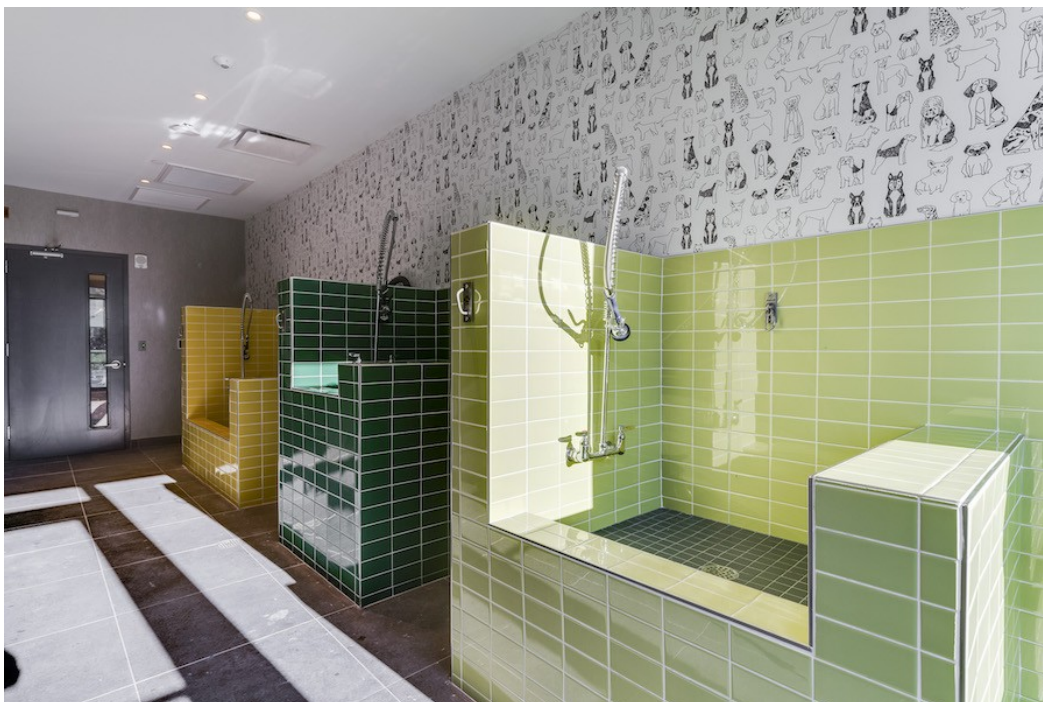
The dog spa accommodates all sizes

There are also seating areas. It overlooks the playground atop the Chesterbrook Academy daycare facility in the retail shops below.