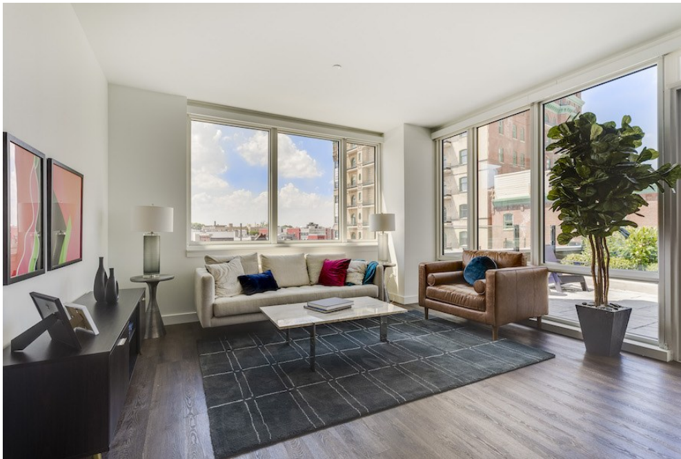
Model apartment living room

There are also some apartments on the amenity floor, facing both terraces. One currently serves as a model unit for prospective tenants.