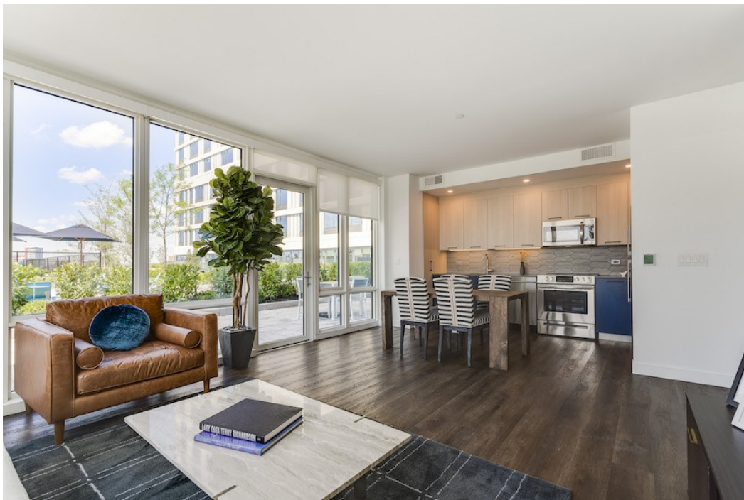
Model apartment main living area

There's a board room next to the co-working space, and the lobby lounge is also equipped for remote work. The books in its library span several decades and are meant to be read. "The idea here is that you can think and get lost in a book by yourself, or the seating can be made more communal," says Levine.