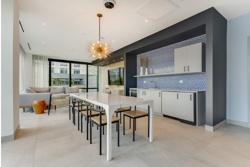
Indoor poolside cabana

The building's fully accessible swimming pool sits at the east end of the terrace. Next to it is an indoor cabana consisting of a lounge with a kitchenette and big-screen TV and bathrooms for changing.