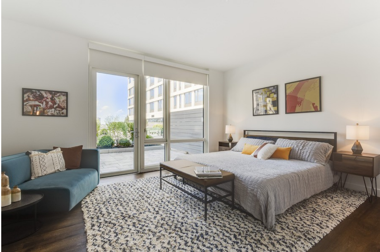
Model apartment bedroom

Another distinctive feature about these apartments: The refrigerators in their kitchens have built-in wine racks. “We thought they would be much appreciated,” says Levine.