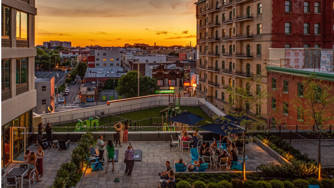
The west terrace, situated next to the Divine Lorraine Hotel, offers a great view of the sunset over Fairmount

Besides a chance to view gorgeous sunsets, the west terrace offers opportunities for active recreation: a yoga lawn, dog run, and table tennis tables all grace this space.