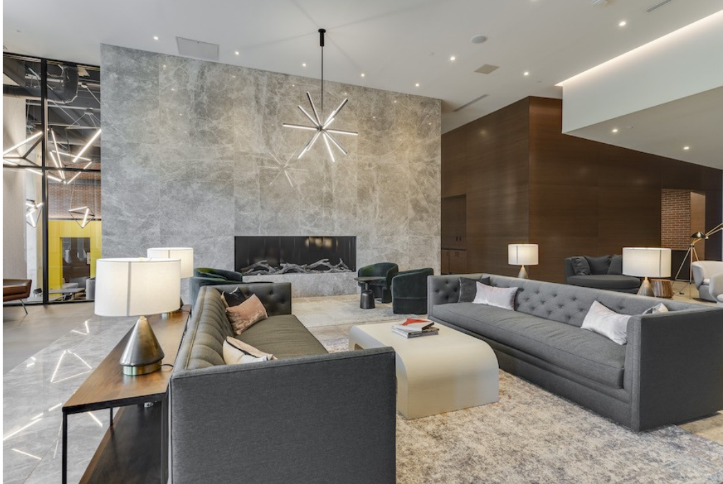
Lobby lounge

There's a board room next to the co-working space, and the lobby lounge is also equipped for remote work. The books in its library span several decades and are meant to be read. "The idea here is that you can think and get lost in a book by yourself, or the seating can be made more communal," says Levine.