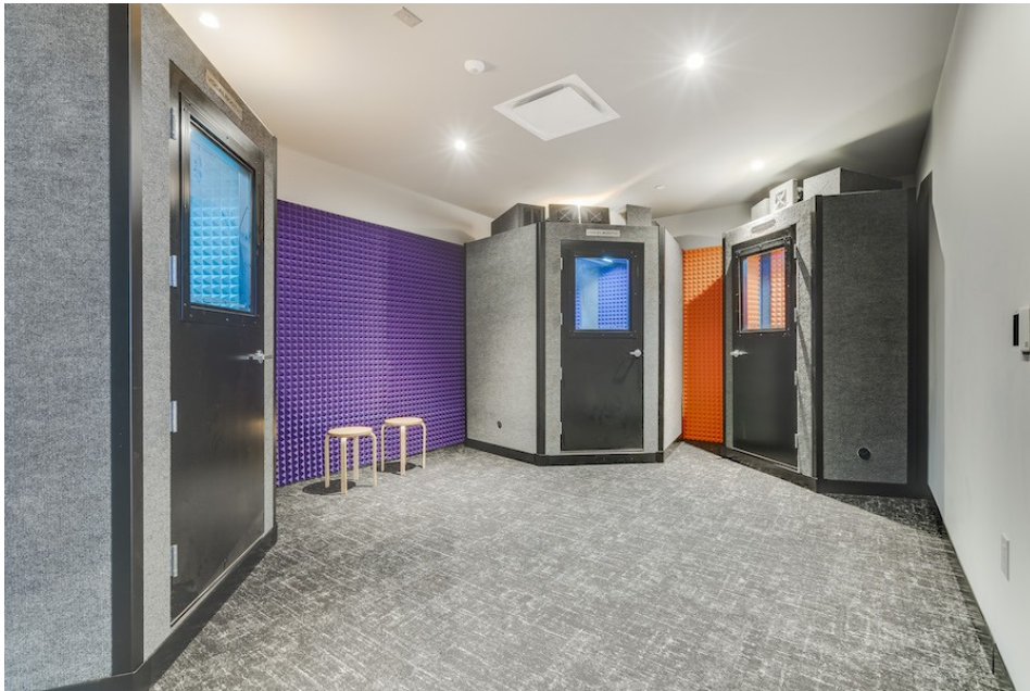
Podcasting studios | Photo: RAL Companies

Broadridge also offers tenants a screening room next to the indoor cabana that can be booked for parties and events. While it has no popcorn machine, it does have a microwave oven and fridge for you to prepare snacks and store cold beverages.