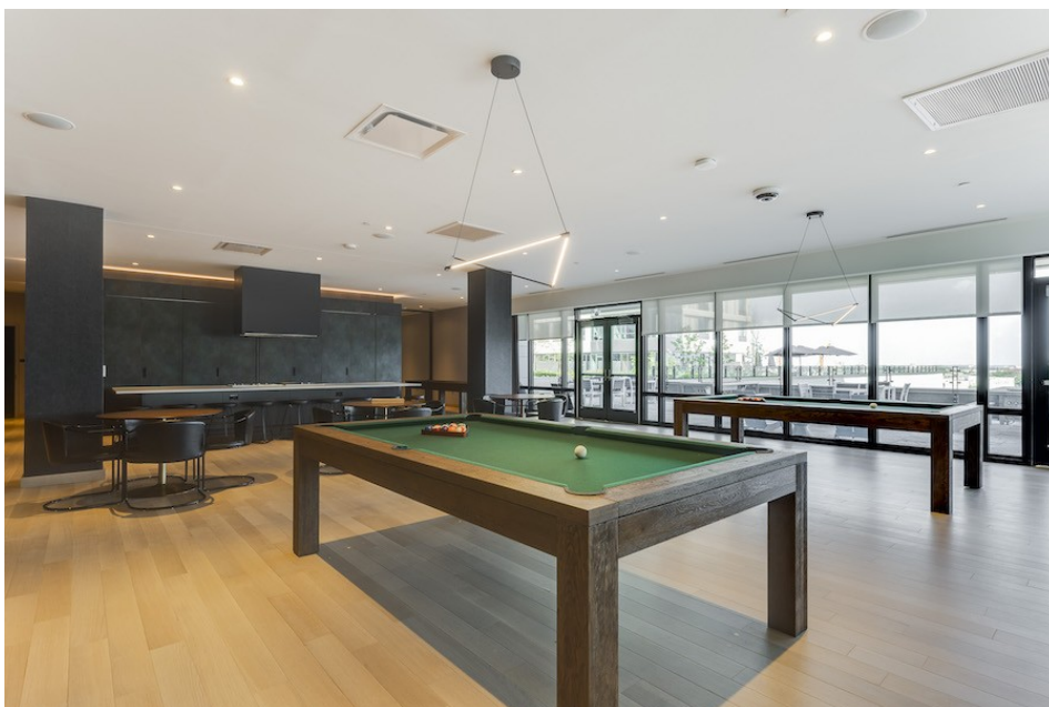
Club room and demonstration kitchen

The dining area next to this kitchen includes two eight-foot-long dining tables with grills in their middle, which may make this building one of the few in the city — maybe even the only one — where tenants can treat their friends to Korean-style barbecue or a Japanese-steakhouse production.