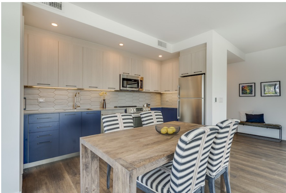
Model apartment dining room and kitchen

Each amenity-floor apartment has its own private terrace, separated from the community terrace by a row of low bushes. Levine says the bushes delineate the private space without making it feel claustrophobic by allowing a view to the larger terrace.