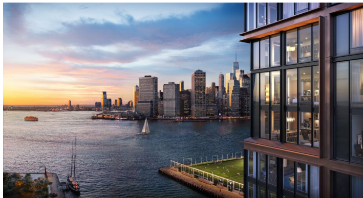
Birds-eye view of Quay Tower

The park across from the building is ideal for young families, with a busy playground, walkways through overflowing greenery, and plenty of space to play. For commuters working in Downtown Manhattan, the newly opened ferries have a station right on Pier 6, just two stops away from the city. The official address is 50 Bridge Park Drive.