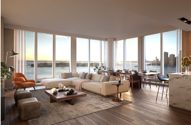
Living room in Quay Tower

The 315-foot-tall structure yields 274,500 square feet for residential use. 126 residencies will be created, averaging 2,180 square feet apiece, indicating large layouts.