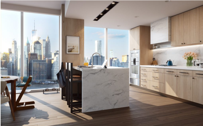
Quay Tower kitchen

Shared indoors lounges will be available on the first and second floor, with an open rooftop terrace serving as the crowning jewel.