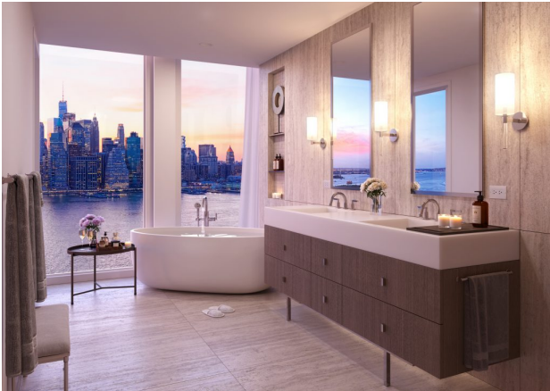
Master Bath, rendering of Quay Tower

Units range in size from two to five bedrooms. Prices start around $1.9 million, with $5.5 million expected for the five-bedroom spreads.