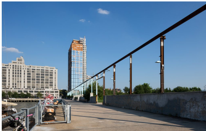
Quay Tower

New York-based ODA Architects is responsible for the design. The curtain wall façade is decorated with brushed copper-hued metal that resembles the iron girders on Pier 6.