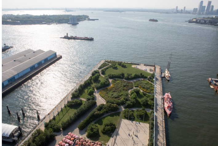
Pier 6 from Quay Tower, image by Andrew Campbell Nelson

The park across from the building is ideal for young families, with a busy playground, walkways through overflowing greenery, and plenty of space to play. For commuters working in Downtown Manhattan, the newly opened ferries have a station right on Pier 6, just two stops away from the city. The official address is 50 Bridge Park Drive.