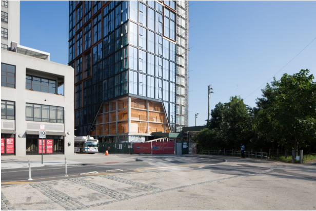
Quay Tower base

The residences will feature oak flooring, ceilings over nine feet tall, and in-unit washer and dryers. There will be an option to integrate Amazon Echo. Private elevators will be included for west-facing residences to travel directly from the lobby into the apartment.