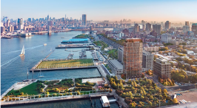
Quay Tower Aerial View

The building will be packed with amenities, including a fitness center, dog spa, conference rooms, kids rooms, and bicycle parking.