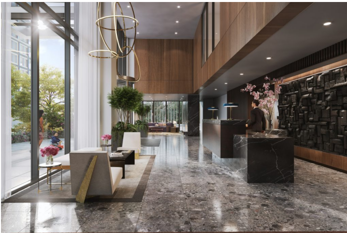
Quay Tower Lobby

After topping out in June, the façade installation has progressed smoothly, with portions of the curtain wall now reaching the rooftop terrace.