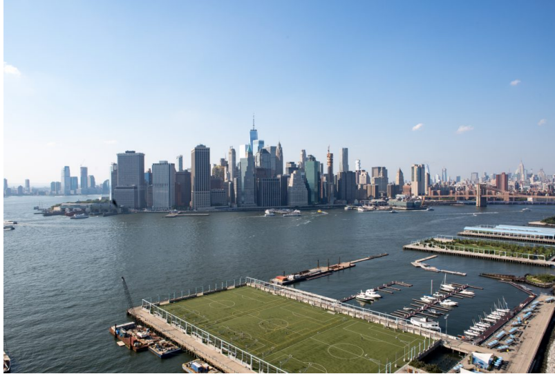
Financial District view from Quay Tower

Completion is expected by next year. Douglas Elliman Development Marketing is handling sales and marketing.